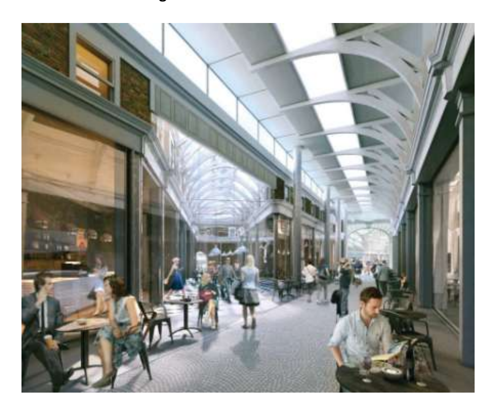
The Current Interior of the Fish Market

The Henderson view along the internal arcade of the Fish Market or Annexe.